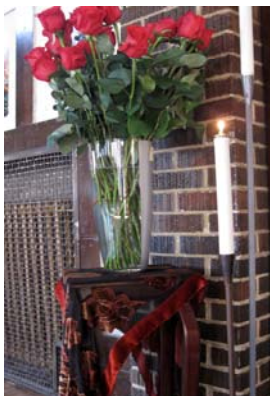
Earth Day Photo

FYI: All identified donations to the Labyrinth of $20 or more automatically receive a tax receipt in February of the following year. Donations of a lesser amount receive a tax receipt upon request.