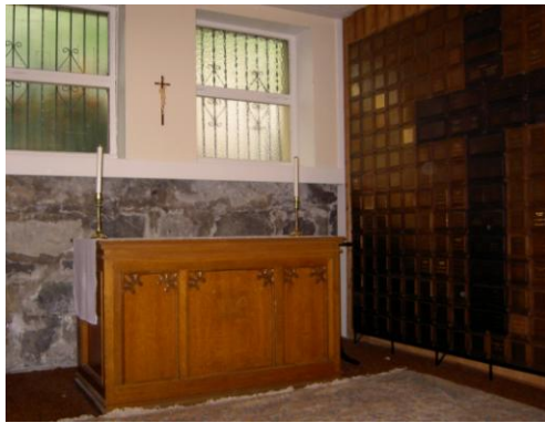
The chapel altar with the Columbarium standing on the south wall

St Paul's Columbarium provides a simple and dignified manner of safeguarding the ashes of deceased persons whose remains have been cremated. The ashes are placed into a sealed box, the box is placed into a chosen niche, and the niche is covered with a bronze plate engraved with the name and dates of birth and death of the deceased.