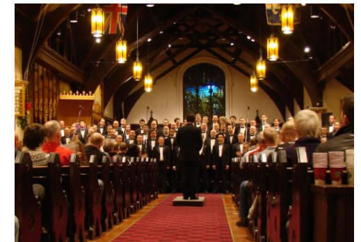
A choral performance at St Paul's

St Paul's church has a warm acoustical ambiance which makes it a sought-after venue for vocal and instrumental performances. For information about rental, contact the parish office by telephone at 604-685-6832 or by email at office@stpaulsanglican.bc.ca