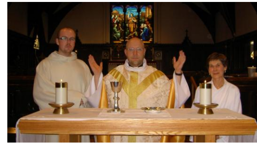
The priest and lay ministers offer the bread and wine

At the 10 o'clock celebration on the first Sunday of the month we combine the intimacy of the 9:15 am service with the formality of the 11 am service. We place the altar in the midst of the people and we conduct innovative liturgies.