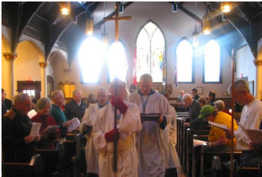
The processional cross leads the liturgical ministers

At St Paul's we seek, as a community, to find the way to God, the ground of our being that upholds us and gives meaning to our lives. We do this through prayer and by proclaiming, teaching and sharing the Christian message and its prophetic witness as they have been handed down to us by our mothers and fathers in the Faith.